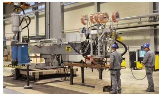
Welding laboratory: Multi-wire Submerged Arc Welding (SAW)

ArcelorMittal's full engineering approach begins with characterisation of materials and continues through to component testing.